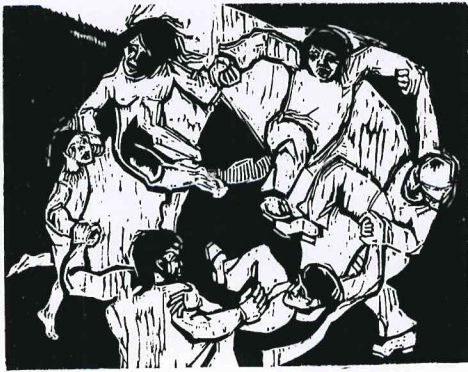
Church of the Servant membership print: Children of the Light